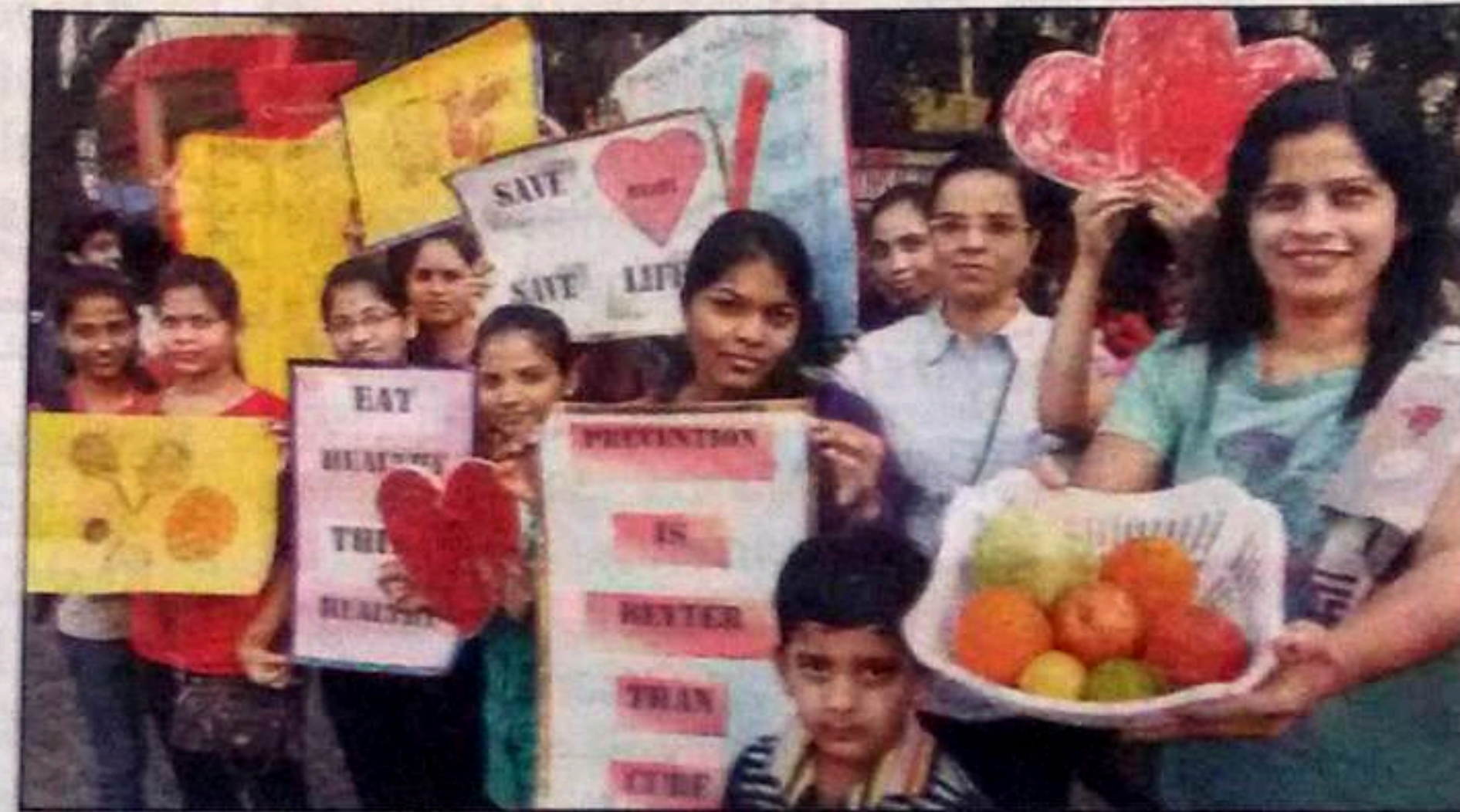
ROAD RAGE: Equal Streets saw over 50,000 Mumbaikars last week

This Sunday, there will be more than 20 free activities. For the first time, experts from Grooming Babies will organise an impromptu call