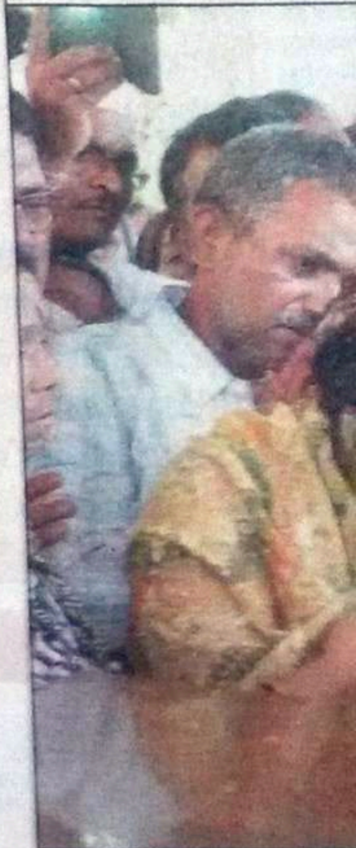
The last rites of army ja Vikhroli on Saturday. D